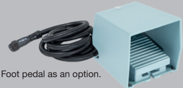
Foot pedal as an option.

Foot pedal (part no 691563) Electric backstop Mechanical back stop device Tool base with QuickChange-tool for P32 dies, 18 slots (part no 720198) Tool base with QuickChange-tool for P32 dies, 8 slots for 140 dies / 6 slots for 32 dies (part no 719124) Tool rack with QuickChange-tool (part no 692740) QuickChange-tool (part no 701049)