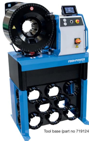
Tool base (part no 719124)

Largest table top machine with more power and wider opening to crimp the heavy duty fittings. P70SCC is ideal machine also for small to mid range industrial hoses.