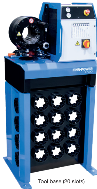
Tool base (20 slots)