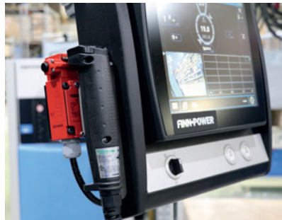
Remote control unit as a standard feature.