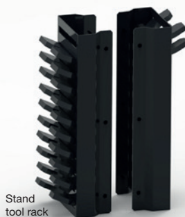
Stand tool rack