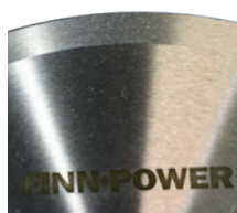
Smooth blade as an option.