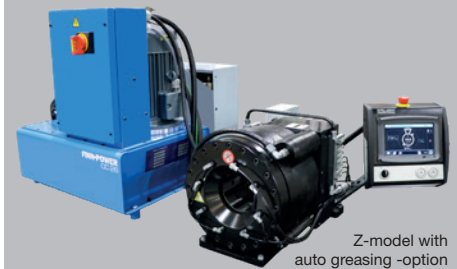
Z-model with auto greasing -option

QuickChange-tool (part no 691043) Foot pedal (part no 691563) Tool table with QuickChange-tool (part no 714065) Mechanical back stop device (part no 691562/P51MS) Quality control ICC3 Graphical quality control ICC4 Auto greasing G3 Interface pack ETH (Communication TCP/IP & UDP) A3 signal Bar Code Reader BCR