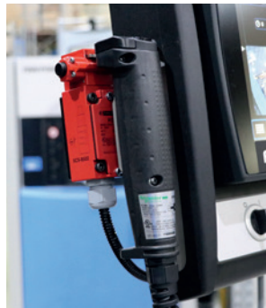
Remote control unit as a standard feature.