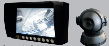
Camera with display as a standard feature.

Oil Condition Monitoring OCM Adapter dies for 160-series die sets, L220 (part no 404916) Oil cooler J3 A3 signal