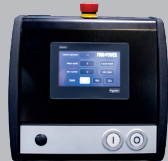
Touchscreen as standard feature

* Motor Brake Maintenance free electric motor brake enables fast stopping of blade rotation.