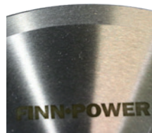
Smooth blade as an option.